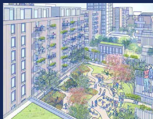
Sketch image view over the podium gardens