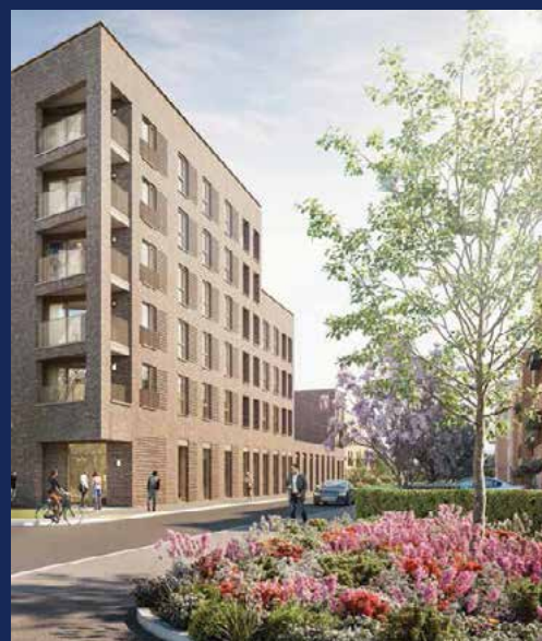
CGI of high quality homes in Phase 2