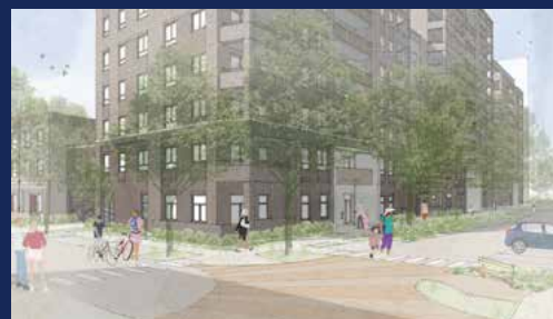
Sketch view - looking north west at junction of Washington Avenue and Somerset Road